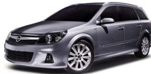
Opel Astra SW